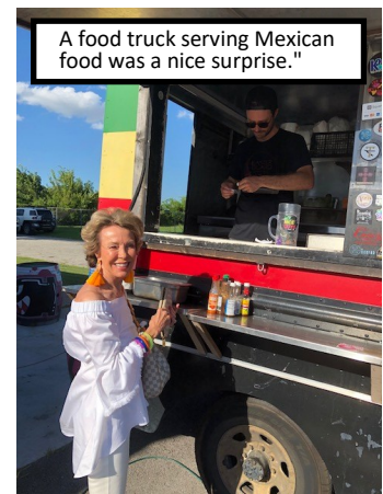
A food truck serving Mexican food was a nice surprise."