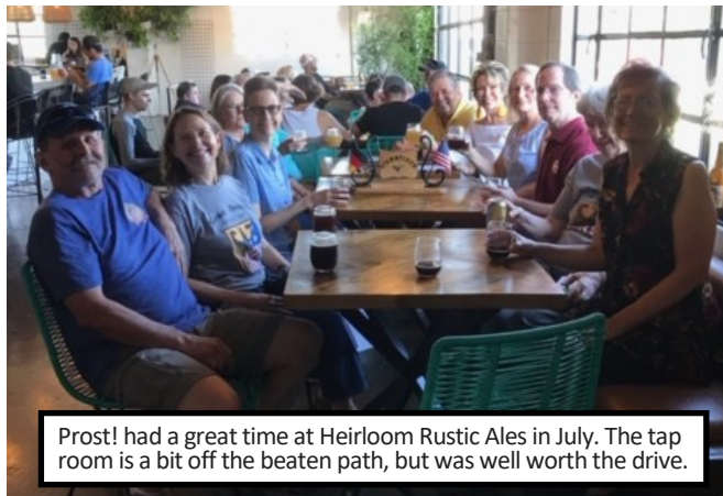
Prost! had a great time at Heirloom Rustic Ales in July. The tap room is a bit off the beaten path, but was well worth the drive.

As always, no need to RSVP for Prost! events. Just come on down and look for the GAST table.