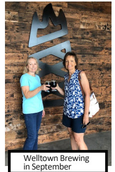
Welltown Brewing in September

September - As Petula Clark once sang: "Go downtown, you can forget all your troubles, forget all your cares!" Prost! is going to downtown Tulsa in September, gathering at Welltown Brewing . Their tap room is located in a beautifully renovated building with plenty of seating and a Caribbean Queen Stout that is DELICIOUS! Parking is always a challenge downtown, but the event manager mentioned that when there are no events scheduled in downtown, the big parking lot across the street offers $1 parking. Stay tuned.