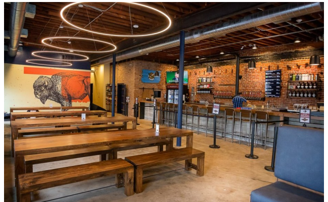
A highly anticipated trip to Marshall Brewing Company is scheduled for August. (See pg 7)

Our plan is to go to a different brewery each month until we've exhausted the list then we'll go back to the top of the list returning to our favorites. They're all unique so it may be hard to choose a favorite! So far, we've been to Cabin Boys Brewery and Heirloom Rustic Ales.