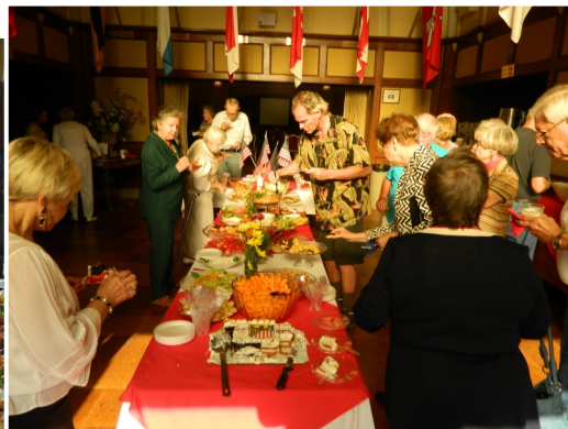
Cake and refreshments were served in the front hall of the GAST Center.