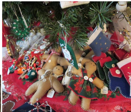
Clockwise from top right, specialty sewn item, steins, the GAST laden and Great Hall in full regalia.

Good food, fine crafts and traditional German food make Christkindlmarkt a fun shopping experience for the family.