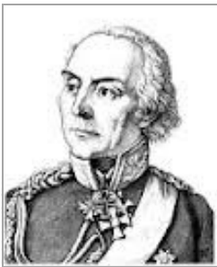
Ludwig Yorck von Wartenburg

Two hundred years ago this month, Generalleutnant Ludwig Yorck von Wartenburg, a Prussian military officer took a bold and defiant step to wrest Germany from Napoleonic control. In 1812 Prussia, and most of the German states, were members of a forced alliance with France, and under the Treaty of Tilsit, Prussia was obligated to support Napoleon in his invasion of Russia. Many Prussians officers had left the army or defected to Russia to avoid this hated service,