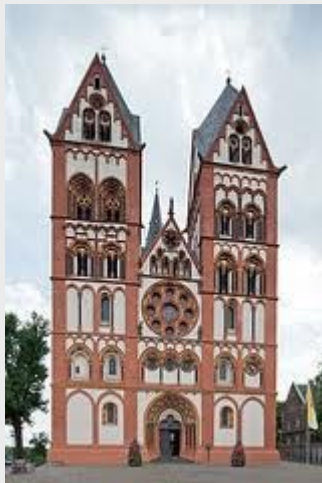
Inside and outside views of this well-known structure.