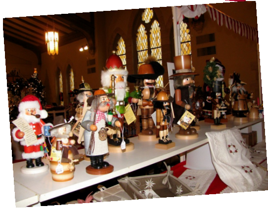
Clockwise from upper left: (1) GAST Bäckerei, (2). Harpist, (3). Christkindl & St. Nikolaus, (4).roasted almonds vendor, and (5) authentic Nutcrackers display