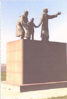
Emigrant Memorial in Bremerhafen, Germany Father looking forward, and the mother looking back

On Sunday, October 3, commencing at 3 PM at the GAST Center 2301 E. 15 th Street, one block west of Lewis