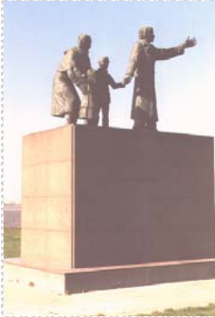
Emigrant Memorial in Bremerhafen, Germany Father looking forward, and the mother looking back

On Sunday, October 3, commencing at 3 PM at the GAST Center 2301 E. 15 th Street, one block west of Lewis