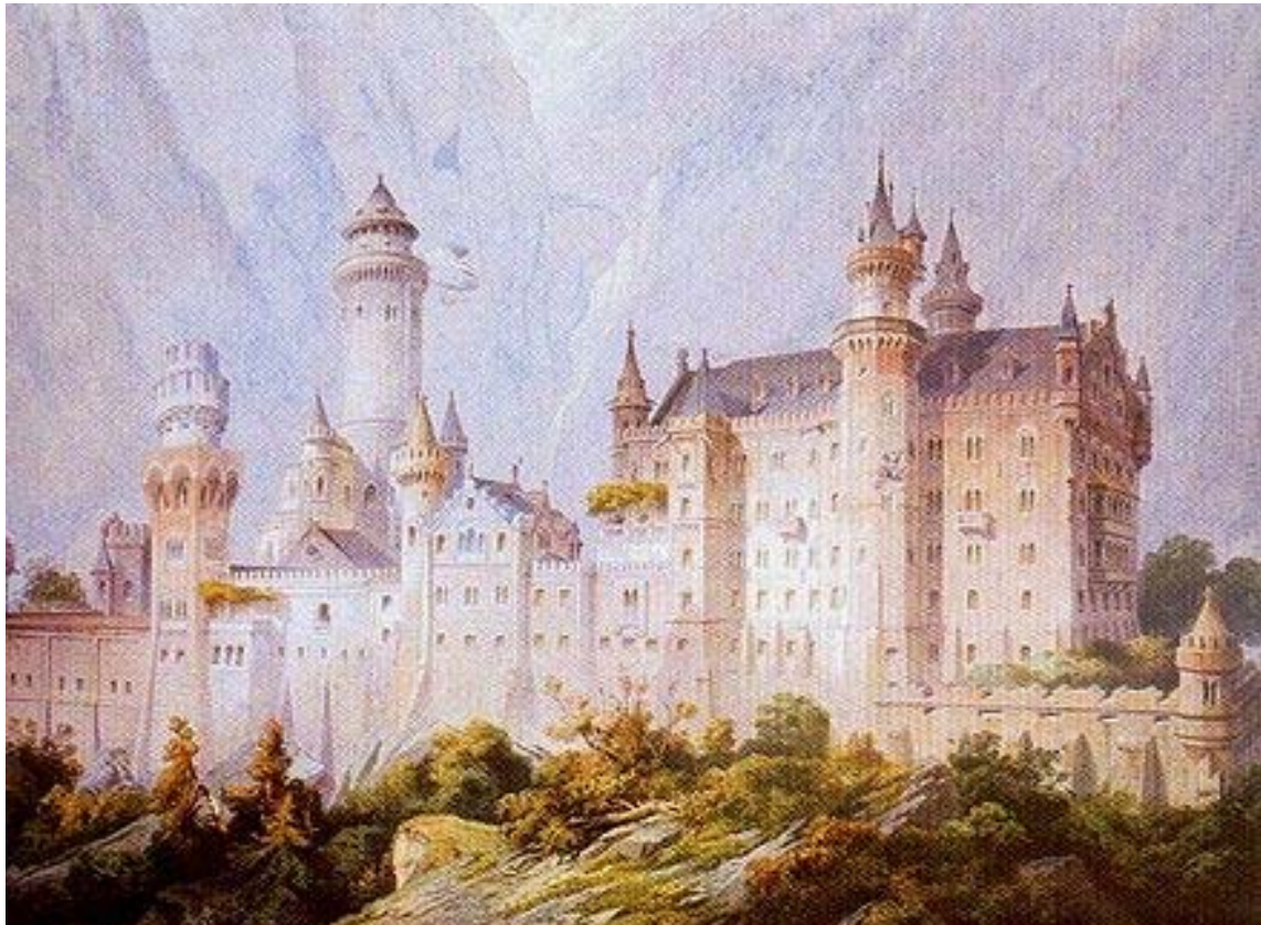
Neuschwanstein project drawing (Christian Jank 1869)