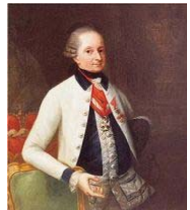
Prince Nikolaus Esterházy, Haydn's most important patron

Joseph Haydn was the brother of Michael Haydn, himself a highly regarded composer, and Johann Evangelist Haydn, a tenor. He was also a close friend of Wolfgang Amadeus Mozart and a teacher of Ludwig van Beethoven.