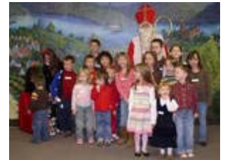
St. Nikolaus Party on December 12, 2009