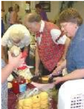
Strawberry Shortcake, anyone?

The voice of the German-American Society of Tulsa