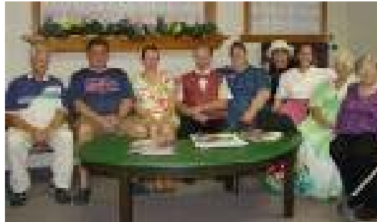
The Cleanup Crew. Yes, it takes a lot of work to cleanup the mess!