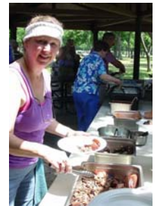
Hurry up already