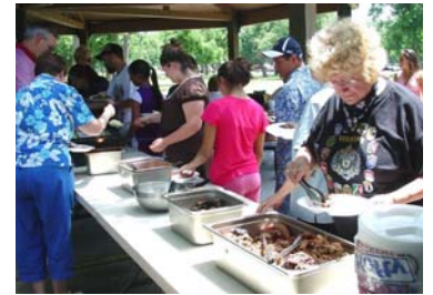
The Chow Line