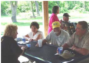
All done already?