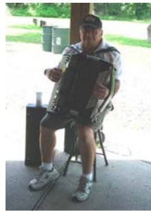
The Music Man