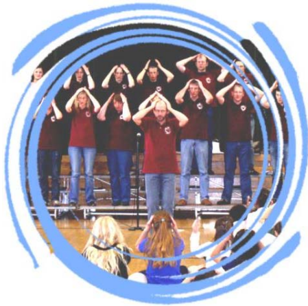
Playing to the kids

The voice of the German-American Society of Tulsa