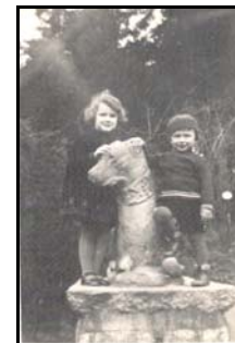
Me and a friend by the Stone Dog