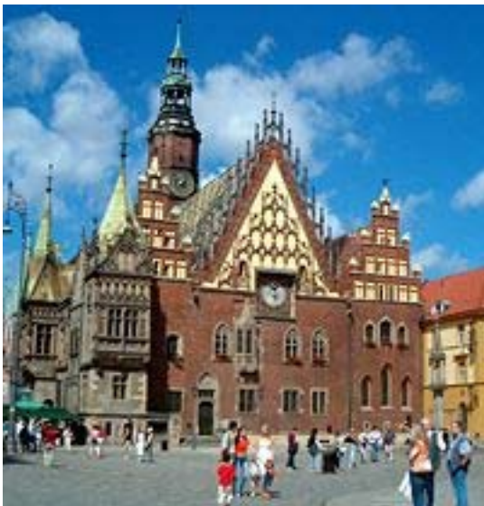
Wroclaw historic City Hall built in a typical fourteenth century Brick Gothic Style