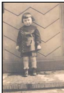
Me at the front door