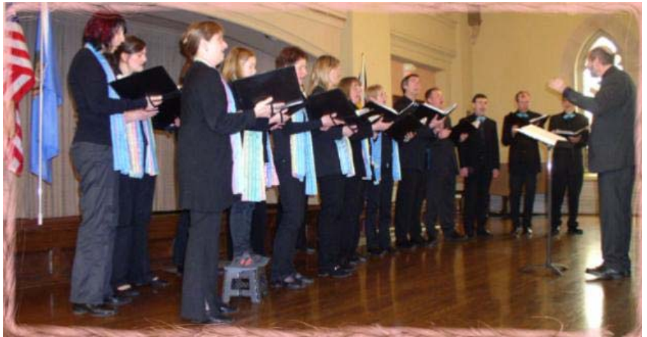
Playing to GAST