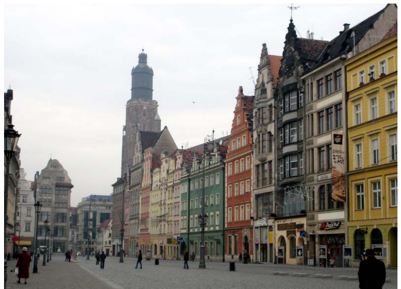
Town square and St Elisabeth church in Wroclaw