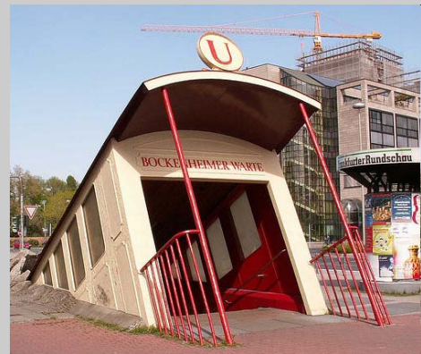
Quirky Subway Entrance