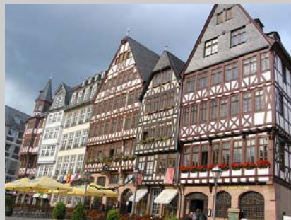
Old Town Frankfurt