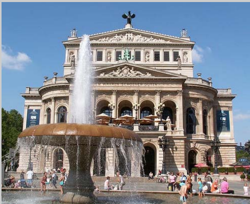
The old Opera House