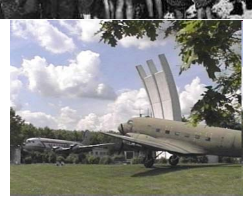
The Airlift Memorial at Rhein Main Air Base in Frankfurt, Germany