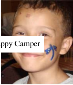
One Happy Camper