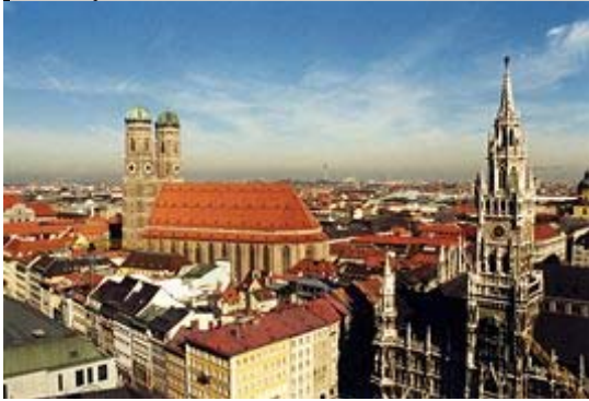
Frauenkirche and city hall steeple Church of our Ladies (twin steeples)