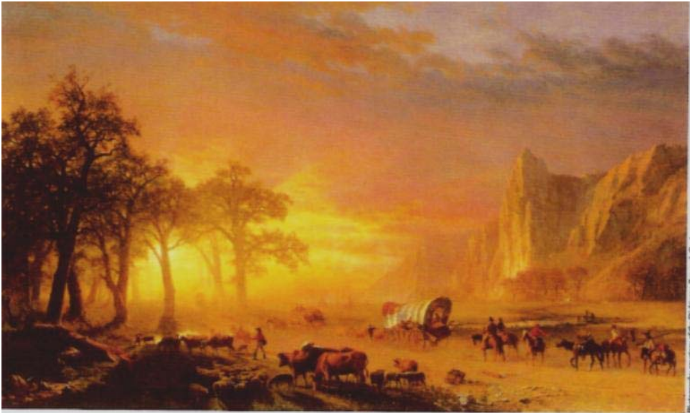
Emigrants crossing the Plains, Oil by Albert Bierstadt

Bierstadt was one of the intrepid German painters, who cataloged the westward movement in the mid-to-late 1800s. Many of their works may be found here in Tulsa at the Gilchrease Museum. This particular painting, however, is owned by the National Cowboy Museum and is currently on loan to the Schirn Kunsthalle Museum in Frankfurt, Germany. It has only been loaned out once before, and that was to the Smithsonian.