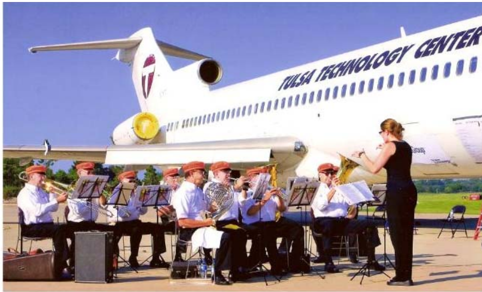
The GAST Blaskapelle at the Riverside Airport during the “Just Plane Fun” program