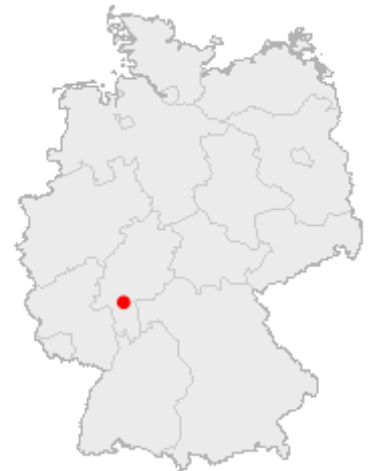
Outline: Germany. Frankfurt shown in red

Frankfurt was one of the host cities for the 2006 FIFA World Cup in Germany.