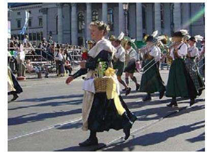
The # 1 Oktoberfest in München

NON-PROFIT U.S. Postage Paid Permit 528 Tulsa, Oklahoma