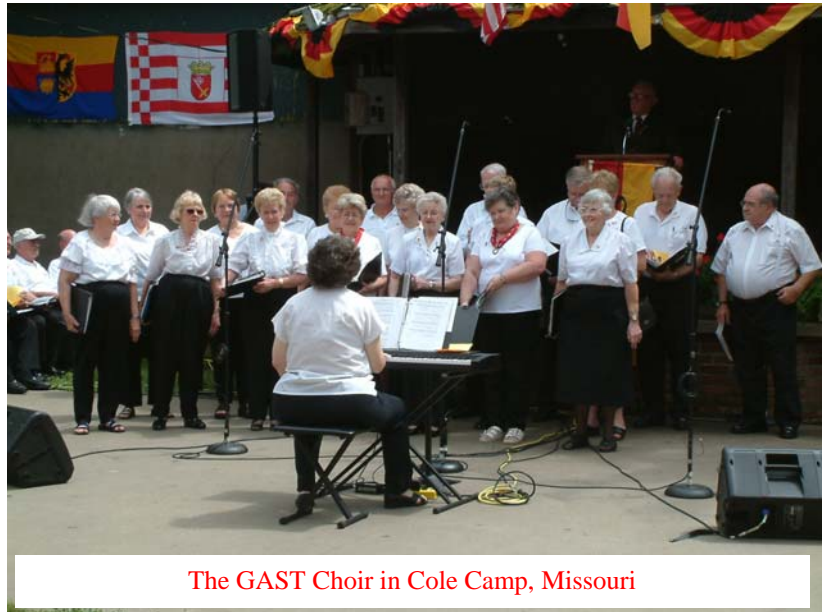
The GAST Choir in Cole Camp, Missouri

The trip to Cole Camp began with song and much laughter on the vans, which continued throughout the trip. Three birthdays were celebrated on Saturday night. More fun and more song was had with a surprise visit from the St. Louis Men's Choir. (We made new friends both as a choir, but also for our organization. We very much appreciate the support we received from GAST— Thank you GAST.