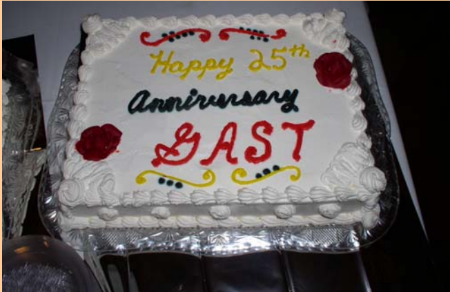
50,000 well-earned calories