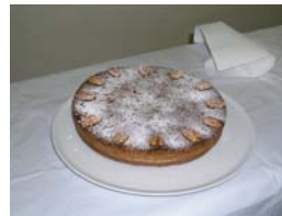
Helga Greiner's famous Rum Cake

So - if you like - get out your hats and show off your stuff! Let's all have some fun!