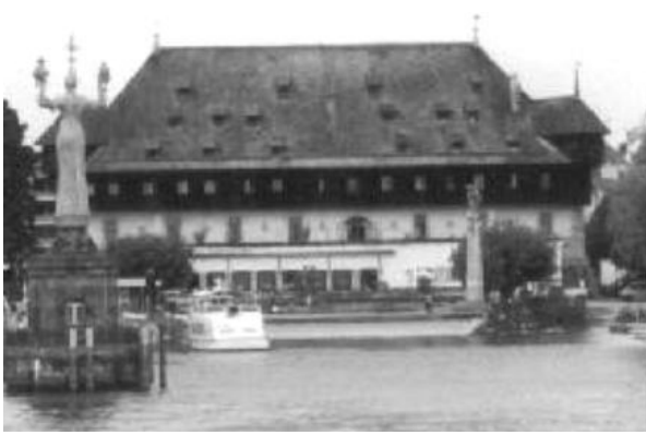
The city's most famous building: The Council Building. The election of Pope Martin V took place here in 1417.