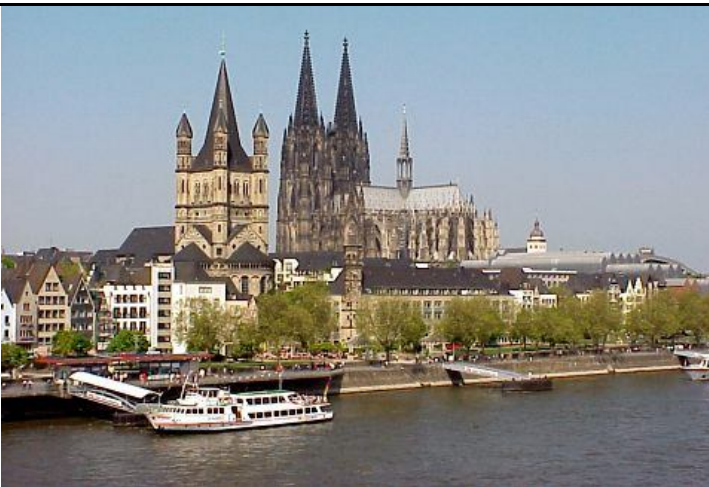
Panorama of Cologne along the Rhine River