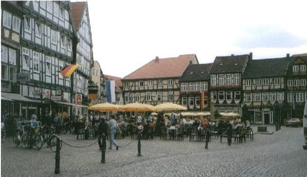
Celle anno 2000 — A gathering place of charm and ambiance

German-American Society Arts Assoc. Das Deutsche Echo 1429 Terrace Drive Tulsa, OK 74104